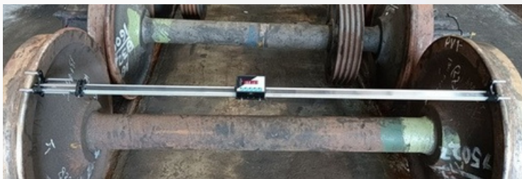
Linspect - W