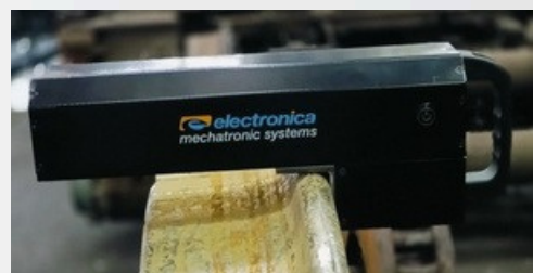
Profispect - W